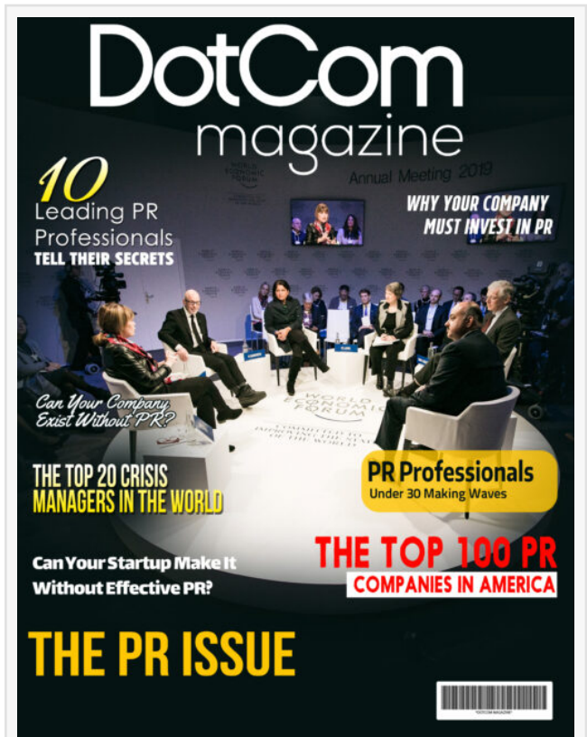
The DotCom Magazine PR Issue