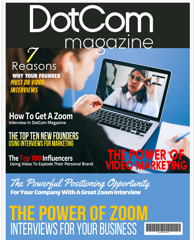
The Power Of Zoom Interview Issue