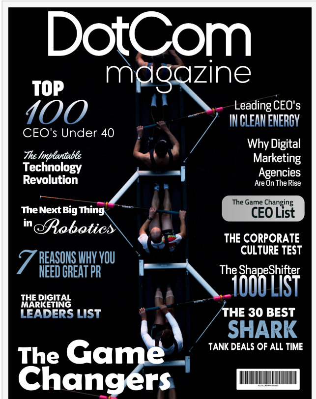
The DotCom Magazine Game Changers Edition

DotCom Magazine is a leading news platform providing fascinating interviews with news makers, thought leaders, and entrepreneurs. DotCom Magazine is the leader in putting people with insatiable entrepreneurial spirit at the forefront of every story it covers. The Entrepreneur Spotlight Interview Video Series looks at business through the lens of a successful entrepreneur's mindset. The Entrepreneur Spotlight Series has included high-profile leaders, including Inc 500 founders, Ted Talk presenters, ABC Shark Tank participants,