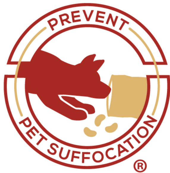
Prevent Pet Suffocation Logo

Click the link below to access the website.