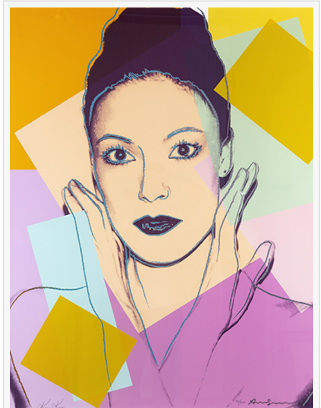
ANDY WARHOL, KAREN KAIN (F.S. II.236), 1980. Signed by Andy Warhol and Karen Kain in pencil. Numbered 87/200, sheet 40 x 32 in — 101.6 x 81.3 cm. Estimate: $30,000-40,000

Register to bid in the auction at www.waddingtons.ca