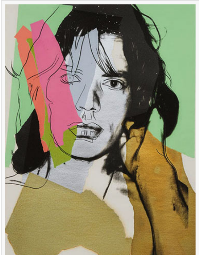
ANDY WARHOL, MICK JAGGER, (F&S., II. 140), FROM THE MICK JAGGER PORTFOLIO, 1975. Signed in pencil by Andy Warhol and in felt tip pen by Mick Jagger, numbered 26/250, sheet 43.5 x 28.9 in — 110.5 x 73.4 cm. Estimate: $60,000-$90,000

Highlighted works in the auction include Lichtenstein's monumental 'View from the Window', lithograph, woodcut and screenprint in colours, from the Landscape Series, 1984. In this work Lichtenstein almost entirely obscures the landscape behind a thicket of obvious brushstrokes, both cartoon and realistic-looking in style – though they aren't brushstrokes at all, but rather printed facsimiles. A nod to his 1960s 'Brushstroke' series, these motifs were central to Lichtenstein's work: rather than using brushstrokes as a tool to make a final image, he made the brushstrokes his subject. Lichtenstein was fascinated by the idea of painting pictures about pictures – as with much of the artist's work, this results in a great tension between flatness and