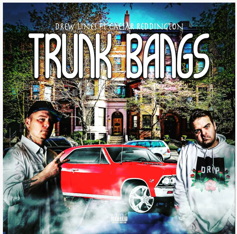
Trunk Bangs by Drew Lines feat Caesar Reddington is available on music platforms worldwide