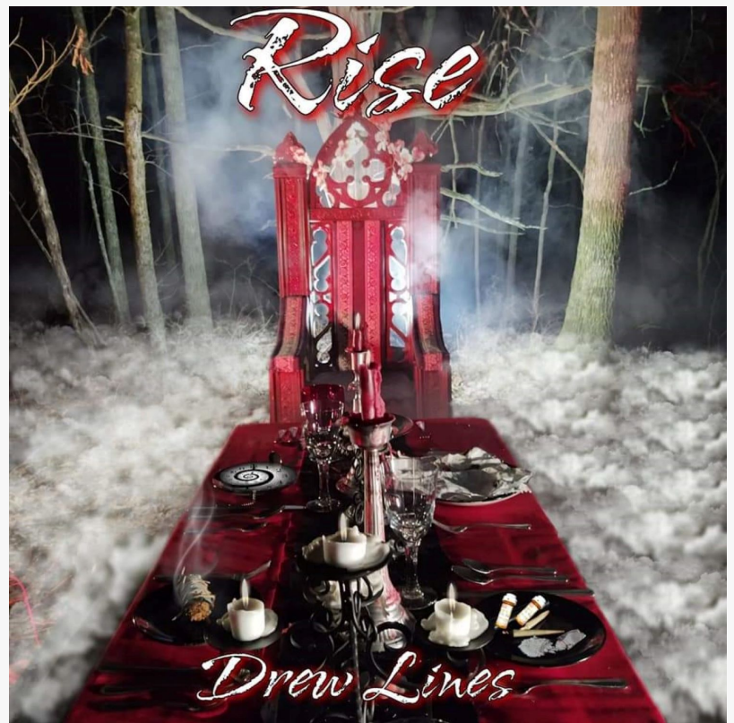
Rise by Drew Lines feat Clio Cadence hit #18 in the nation on the NACC Top 30

This press release can be viewed online at: https://www.einpresswire.com/article/597012151