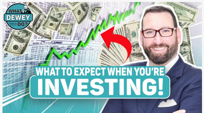
What to Expect When You Are Investing