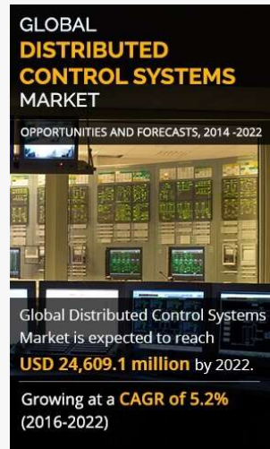
GLOBAL DISTRIBUTED CONTROL SYSTEMS MARKET BY GEOGRAPHY