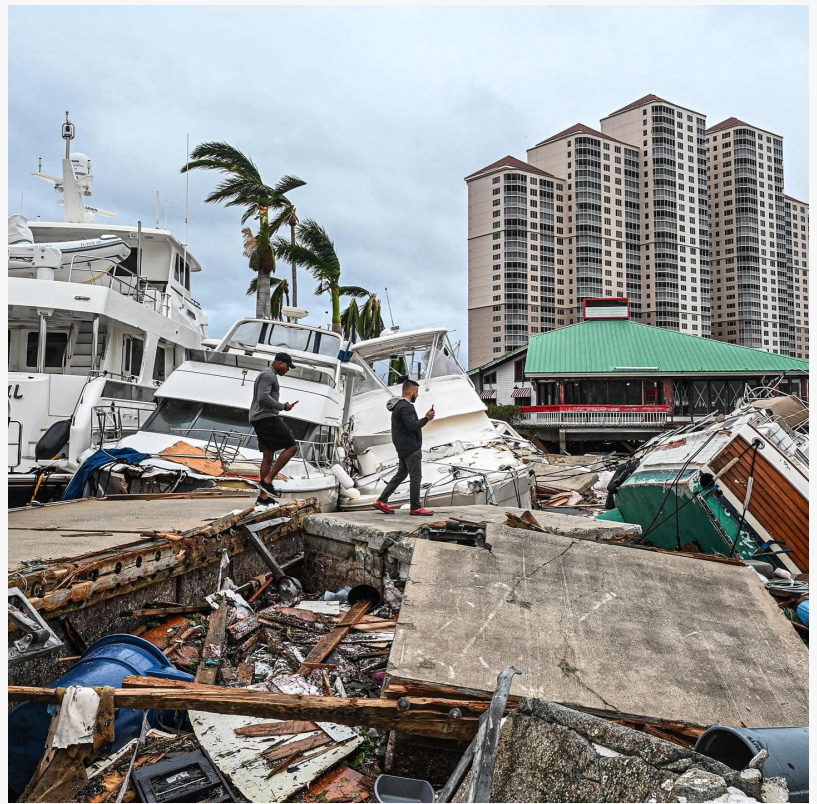
Clean Up Continues from Hurricane Ian