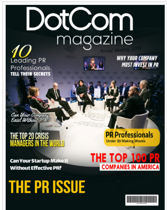
The DotCom Magazine PR Issue