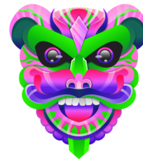
Lil Durk - LilDurk.com