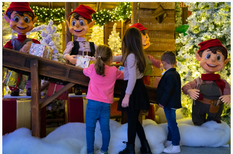
Families will delight in seeing all of the animatronics on display in the showroom transformed into Santa's Village

/EINPresswire.com/ -- Christmas in America is nearly synonymous with the spectacular holiday décor on display in New York City including Rockefeller Center, Macy's, Cartier, and Radio City Musical Hall. American Christmas , the company that decorates those iconic buildings and many more, will open the doors to a dazzling Christmas Experience at their location at 30 Warren Place in Mt. Vernon for the first time starting November 5th.