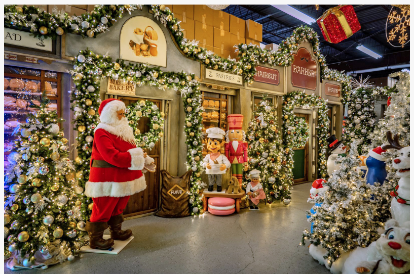
Santa's Village features several Dickens-like vignettes that children and adults will enjoy viewing.