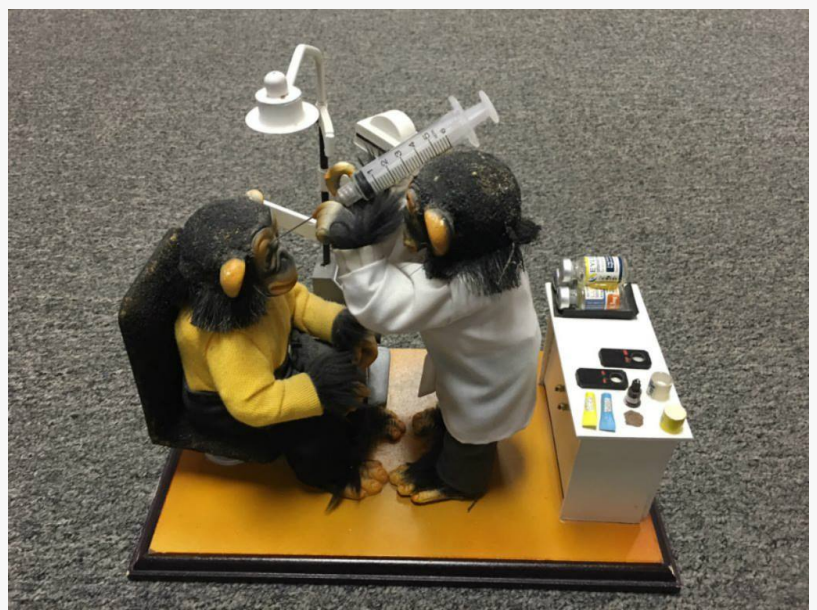
Vabysmo is administered with anesthetic in the eye

many patients doing poorly with other medications or requiring too frequent treatments. Complications have been minor as found with other injections with minimal injection discomfort, occasional superficial hemorrhage on the white of the eye, floaters and minor irritation from the antiseptic for a day. We have had no serious complications such as infections, retinal detachments or systemic problems with Vabysmo. Vabysmo is currently undergoing clinical trials to address a broad variety of retinal and macular diseases such as retinal vein occlusions. If you or a loved one is suffering from DME or wet AMD, we strongly recommend speaking with your doctor about Vabysmo as a safe, effective, and long-lasting treatment option. ``