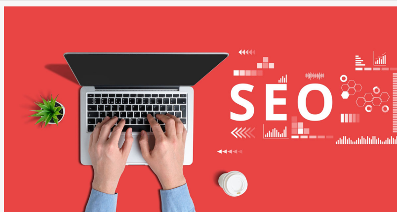
Local Search Engine Optimization Services

Online marketers believe that a strong local SEO strategy is key to driving more visitors to their stores. In fact, mobile-optimized websites also play a crucial role in driving potential consumers to a website. It is true because 61% of searchers use mobile devices to contact a local business if a business has a mobile-friendly website. From gaining organic traffic, and target audience, or building high-quality backlinks, SEO has played a significant role in fetching optimal results.