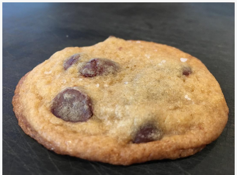
Dark Chocolate Sea Salt Cookies

Lastly, they ordered supplies well in advance to preserve pricing and make sure they are fully able to fill orders through the whole holiday season. They are ready to bake their hearts out and