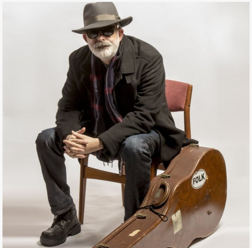
Jack Tempchin, singer/ songwriter/ artist/ musician.