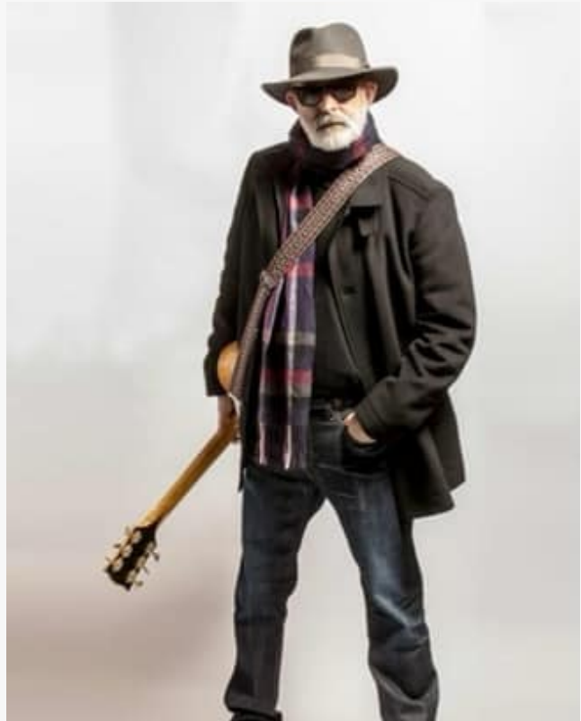
Jack Tempchin, singer/ songwriter/ artist/ musician.