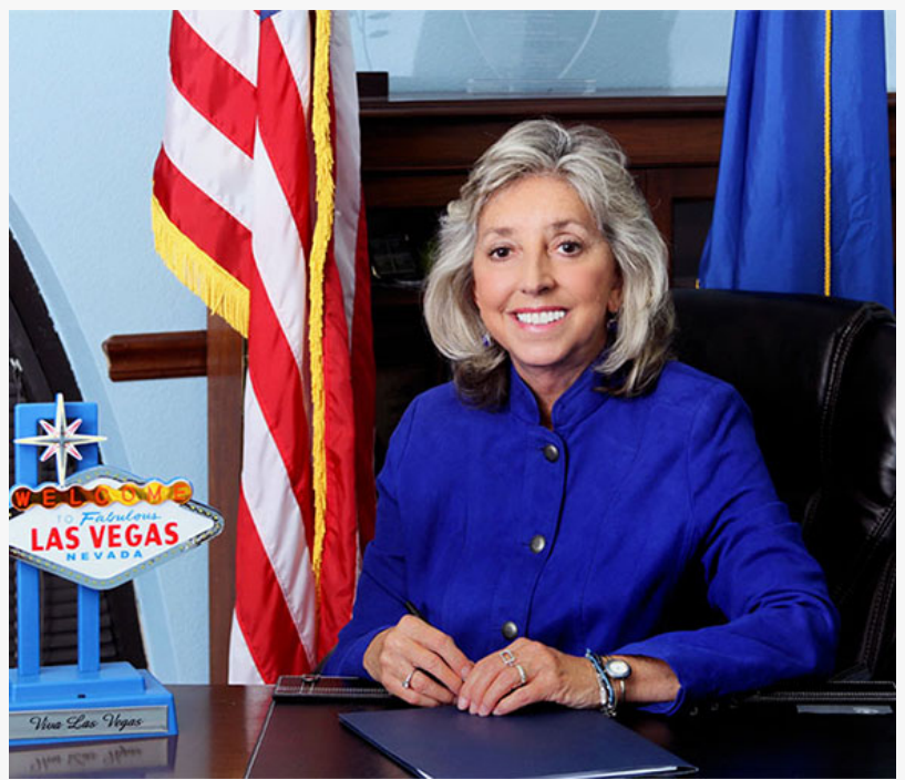
Rep. Dina Titus

Nobody has been more focused and supportive of animal welfare issues than Rep. Titus. In this Congress, she and Senator Gary Peters, D-Michigan, worked to pass the PAW Act in this Congress to direct the Federal Emergency Management Agency (FEMA) to establish a working group relating to best practices and federal guidance for animals in emergencies and disasters.