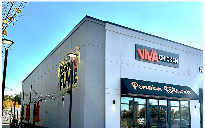
The first 25 guests at Viva Chicken on Barrett Parkway in Kennesaw receive free chicken for a year on Wednesday Oct. 26.