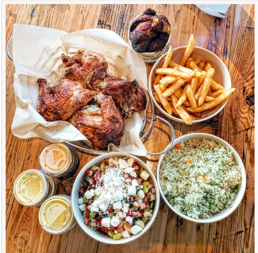
Viva Chicken brings its authentic Peruvian Street Food to Kennesaw, GA, marking the restaurant's 16th location, and entry into Georgia.

“Community support is vital to helping Kennesaw State University (KSU) students overcome food