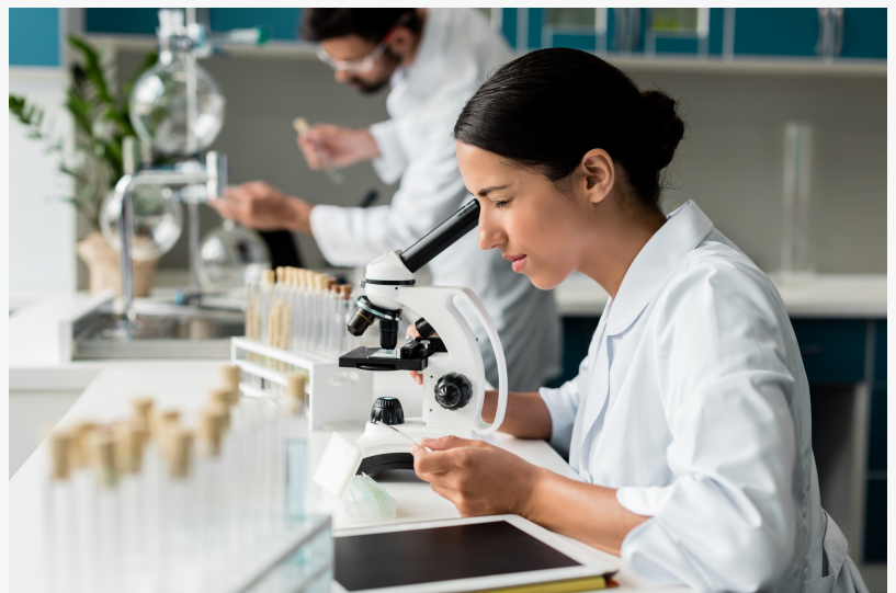
Gadot launches new ingredient: Magnesium Bisglycinate for mental health and energy

HAIFA BAY, ISRAEL, October 25, 2022 /EINPresswire.com/ -- Adding to its robust portfolio of mineral ingredients for dietary supplements, Israel-based Gadot Biochemical Industries has launched pure magnesium bisglycinate , which has higher bioavailability than magnesium carbonate, and sulfate, according to Gadot chief executive officer, Ohad Cohen.