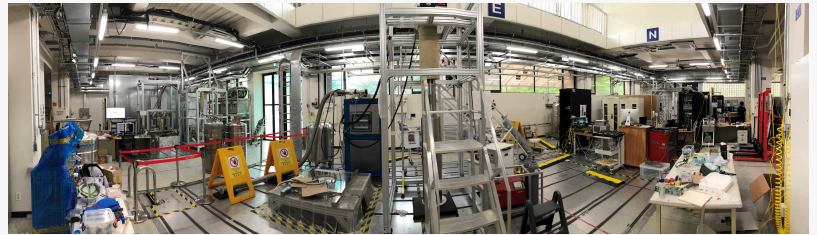
Fig. 3: The CAPP experimental hall allows multiple dark matter search experiments to be installed and operate at the same time. The laboratory includes seven low vibration pads for parallel experimental setups, as well as several refrigerators and superco