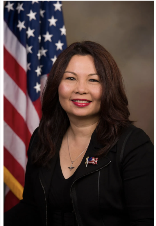
Sen. Tammy Duckworth

Duckworth is also the author of the Lead Endangers Animals Daily (LEAD) Act, S. 4157, to halt the use of lead ammunition on our country's 570 National Wildlife Refuges, which are administered by the U.S. Fish and Wildlife Service. Shards of lead ammunition left behind in wildlife carcasses left behind in forests and or simply dispersed in streams and other wildlife habitats inadvertently poison millions of wild animals every year, from bald and golden eagles to loons to bobcats and wolves. In 1991, the U.S. Fish and Wildlife Service banned the use of lead ammunition in waterfowl hunting, and waterfowl hunting has continued uninterrupted, reducing lead poisoning, and protecting the species for a variety of wildlife uses, including hunting. Dozens of states have restrictions on lead ammunition, and California has eliminated its use entirely. The nation has taken steps to reduce human exposure to lead by phasing its use out in gasoline,