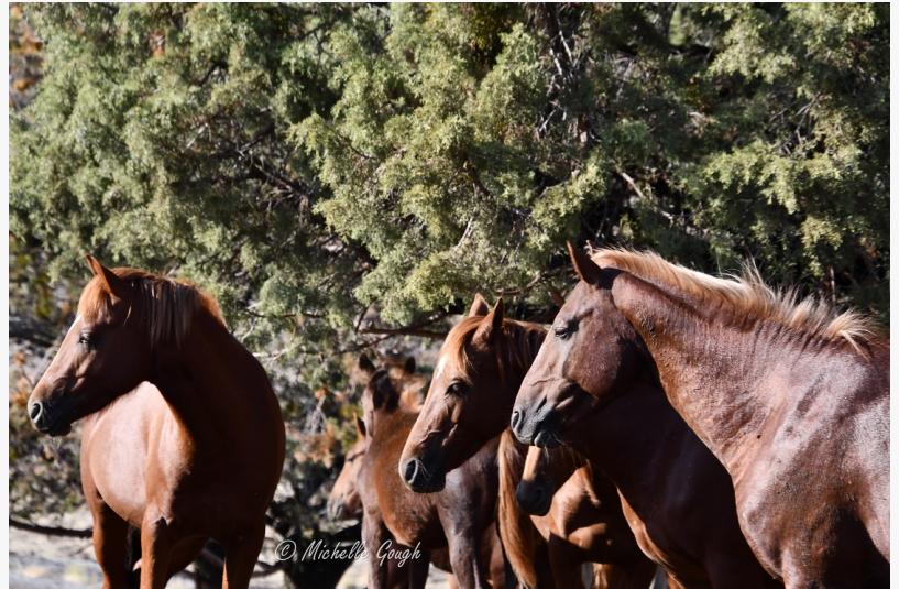
A family of wild horses

This new music video, produced by California nonprofit ' Wild Horse Fire Brigade ', titled 'We Are the Wild Horses' has been Officially Selected by the 2022 EQUUS Film & Arts Festival and will be premiered during the 10th annual EQUUS Film & Arts Festival in Sacramento California.