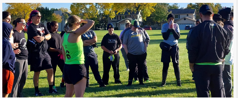
Participants in Tryout #1

informal meet and greet for rookies, recruits, and those with potential interest to gauge what women's tackle football Mountain Lion-style is all about. Following the session, from 3-5, tryouts will commence. For those who feel too shy, unsure, curious, worried about inclusivity, or any other concern that may be holding them back, it is encouraged to show up at 2pm to have those worries assuaged. Tryouts will have a $20 fee attached for anyone interested in participating. One on One Sports requests that no cleats be used on their surfaces, so please bring athletic or turf shoes to this particular event.