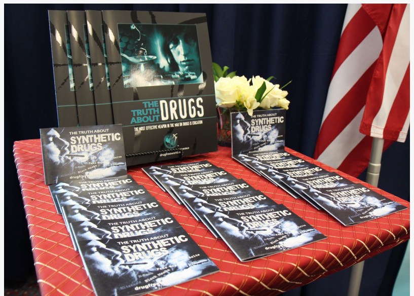
Foundation for a Drug-Free World materials include the Truth about Synthetic Drugs.

Thalia Ghiglia Drug-Free World +1 202-667-6404