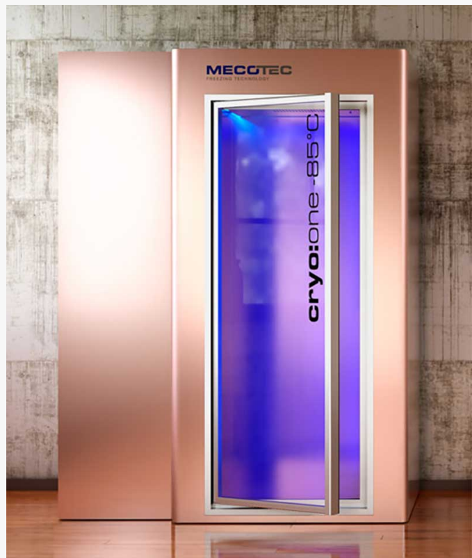
Mecotec Electric Cryotherapy Machine

Experience quality customer care when you shop with The Spa Butler.