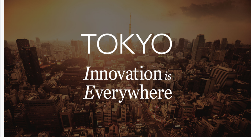
Tokyo: Innovation is Everywhere

The Asian megacity Tokyo continues to retain its number one world ranking for its GDP as a city (As of 2019). An intermingling of cultures is an appeal of Tokyo. Even on the business side, Tokyo proactively receives startups from overseas, and investments are also actively carried out. To expand one's business through the shortest path amid the business customs of Tokyo, where relationships of mutual trust are essential, collaborations with local startup ecosystems are indispensable.