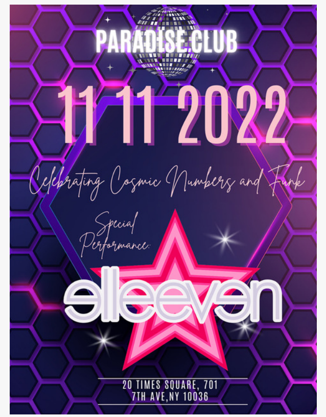
ellee ven at the Paradise Club 11/11/2022

This press ទៀតនទុក្ខខាង viewed online at: https://www.einpresswire.com/article/598090607 Eខាមាខាន់wire's priority is source transparency. We do not allow opaque clients, and our editors