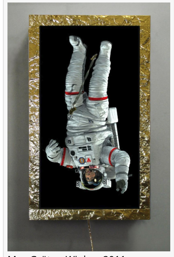
Max Grüter. Winker, 2011.

of the couple's wide interest in the cultures of the world, this exhibition presents over twenty contemporary artists from distinct geographies that explore the spaces they inhabit. The work includes a range of techniques and mediums from video and photography to painting, sculpture, and installation.