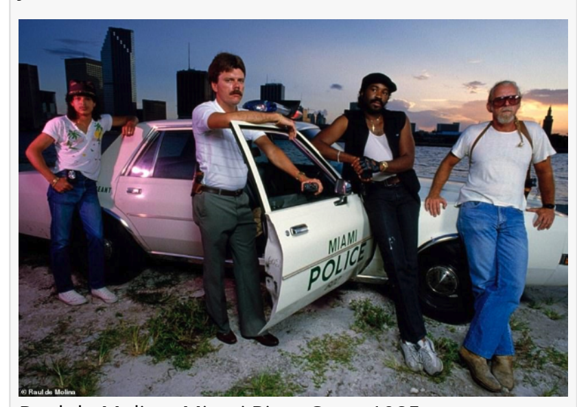
Raul de Molina. Miami River Cops, 1985.

Before finding a niche on television, Raul started his career as a photojournalist for publications such as Time, Newsweek, and USA Today. The exhibition, From the Streets to Television... gathers a selection of images that portray the city during the 1980s. His keen photographic eye led him to capture events that made history - from protests and riots, to drug dealing and police