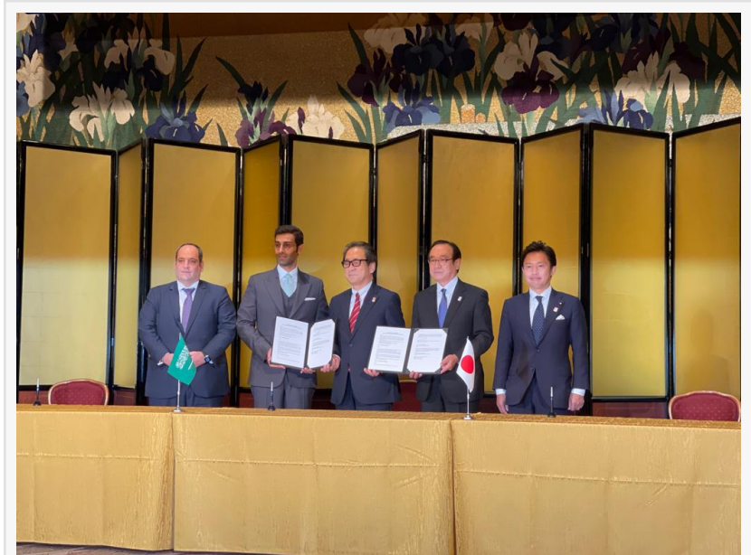
Saudi Arabia confirms participation at Expo 2025 Osaka Kansai, Japan

OSAKA, JAPAN, October 27, 2022 /EINPresswire.com/ -- Saudi Arabia has formally confirmed its participation at Expo 2025 Osaka Kansai on the sidelines of the first International Planning Meeting ("IPM"), reaffirming its commitment to global collaboration. The six-month event, which will unite people and governments from diverse backgrounds, will take place under the universal theme, "Designing Future Society for Our Lives".