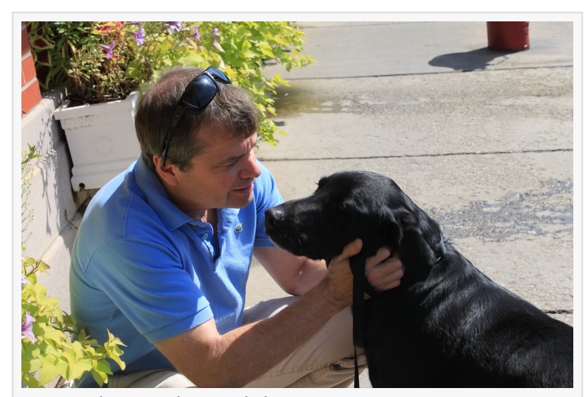
Rep. Mike Quigley and dog

Rep. Quigley is the lead author of the Big Cat Public Safety Act, H.R. 263, to stop the trade in big cats as pets or as props in commercial cub petting operations. He was tenacious in guiding the bill to the floor, passing it