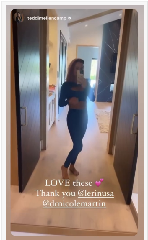
Teddi Mellencamp's Instagram Story