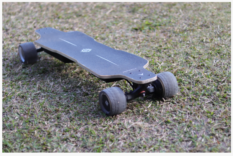
New Electric skateboard Possway Lynx