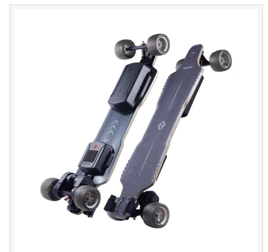
Possway Lynx Just Released

Compared to its predecessor Possway T3, Possway Lynx has many greatly improved features that are listed below: