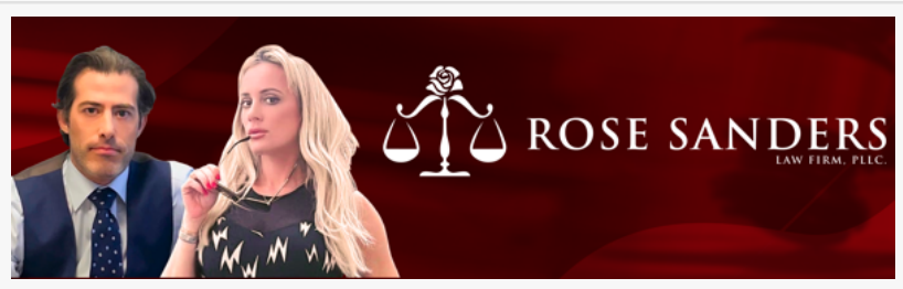
Call the Texas Car Accident Lawyers at Rose Sanders Law

The first thing a person needs to do after being in a car accident is to get medical attention as soon as possible, whether or not it's their fault. In most states, if someone else is at fault for causing a persons injuries, they are required by law to pay for any health care expenses that are incurred due to their negligence. This means that even though a persons insurance company may eventually be responsible for paying all of their bills (assuming that they don't deny them), a person won't have enough money to cover everything yourself until they collect from whatever other party caused the collision. If this happens, the process can take months or maybe even years to go through court before anyone has paid up, which makes getting