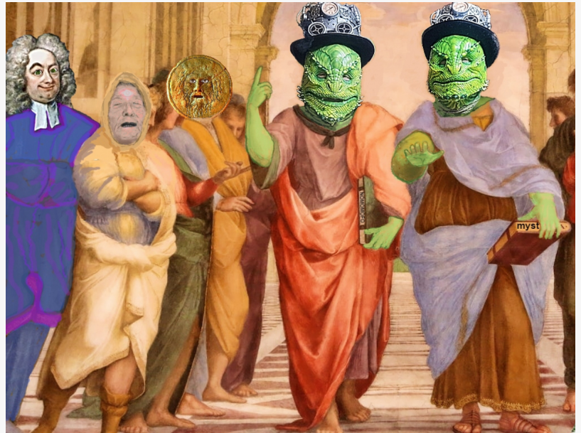
Anunnaki Brothers Respectfully Discuss Satire, Truth, and Free Speech.

NYC, NEW YORK, UNITED STATES, October 31, 2022 /EINPresswire.com/ -- The Anunnaki Brothers Kreego and Enki are two independent minded illegal aliens from the Planet Nibiru who recently published their controversial and satirical " Save The Planet! Eat a Politician Cookbook " where an illustration depicts Nancy Pelosi was hammered with a mallet and turned into a parmigiana style meal.