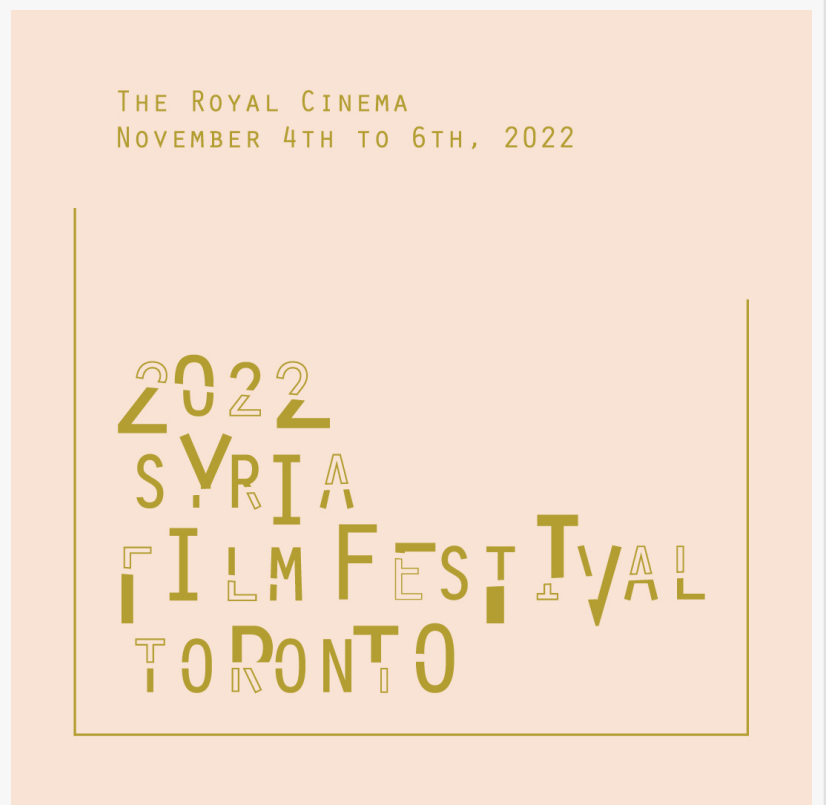
The logo of SYFF 2022

Screening on the second night of the festival is Alejandra Alcala's documentary The Neighborhood Storyteller , the story of Asmaa, a young and education-deprived Syrian woman embarking on a new read-aloud project to empower teenage girls to build a future of