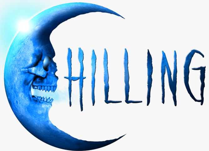
Chilling - A More Intense Way To Relax

Chilling has established an impeccable vertical ecosystem for everything horror. Horror lovers no longer have to browse through endless content on various online platforms to find their desired types of horror stories. With Chilling, there is a massive community of horror lovers who can interact, share their stories, and listen to audiobooks and podcasts at a very low price. They can add their favorite stories to playlists so they can easily find and listen to them any time they want.