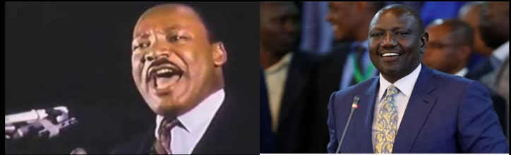
Dr. Martin Luther King Jr. Civil Rights Leader

We ask Kenya's Newly elected President William Ruto and Kenyan leaders to come Memphis to honor the legacy of Dr. Martin Luther King via Kenya supporting "The Tom Mboya/Dr. Martin Luther King Education & Cultural Center" to being built in Nairobi, Kenya