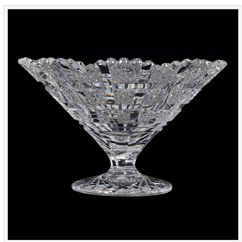
American Brilliant Cut Glass tazza (shallow bowl of wide form, standing on a footed stem), in the Willow pattern by Hawkes, 5 ¾ inches by 9 inches, with a hobstar foot and fabulous blank.

This press release can be viewed online at: https://www.einpresswire.com/article/598790261