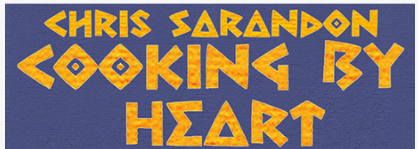
Cooking By Heart podcast show logo- text

Upcoming Guests on Chris Sarandon's 'Cooking By Heart' podcast include: