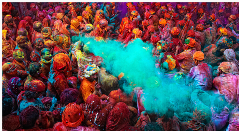
Holi in MP