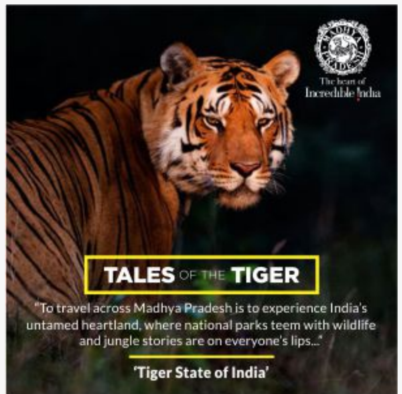
Madhya Pradesh at WTM London 2022

The highlights of Madhya Pradesh include the temples of Khajuraho which are India's unique gift