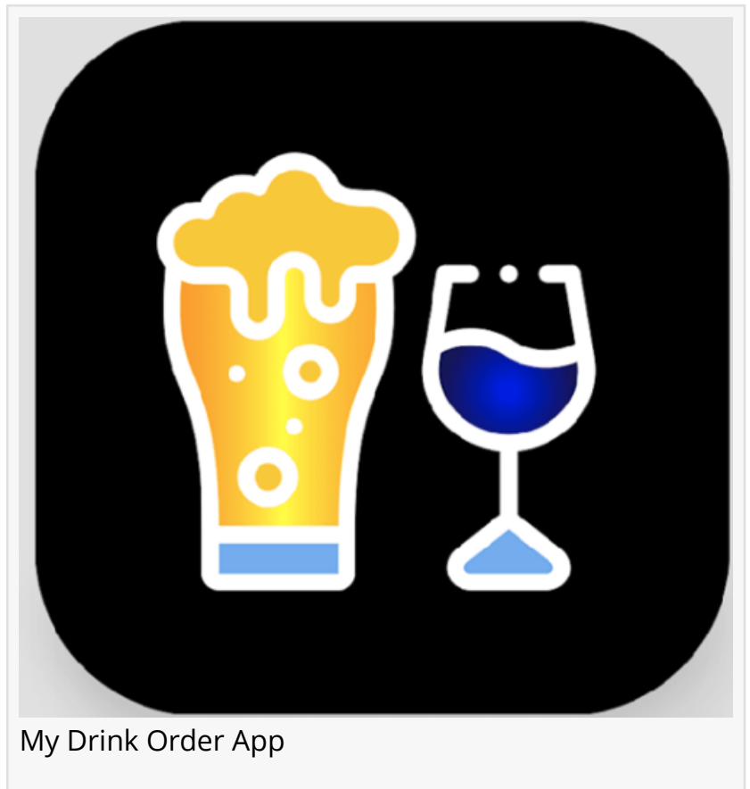
My Drink Order App

HUNTINGTON BEACH, CA, USA, November 3, 2022 /EINPresswire.com/ -- The same group that created Fan2Stage so that you can cheer on live entertainment from anywhere, have created the My Drink Order ® App. We have all had to deal with getting someones attention in loud places. Now there is an easy way. When the bar is loud and crowded and you just want to order a drink now you can use an app to get someones attention. It doesn't matter if you want a soda, beer, wine or a cocktail, the app makes it easier.