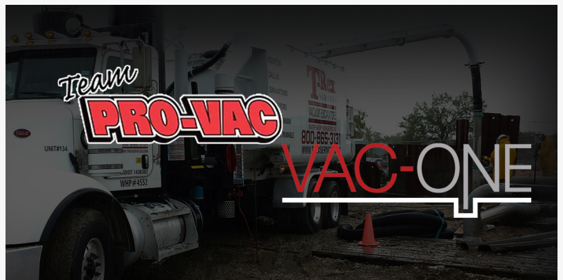
Pro-Vac Acquires Vac-One

What does this merger mean for the teams of Pro-Vac and Vac-One? They will all work together over the next several months to integrate our organizations. We will evaluate and incorporate the best processes, training, benefits, etc. from both organizations ultimately enhancing our capabilities to offer consistent, safe services across the nation.