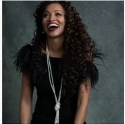
Rina Chanel Black Dress