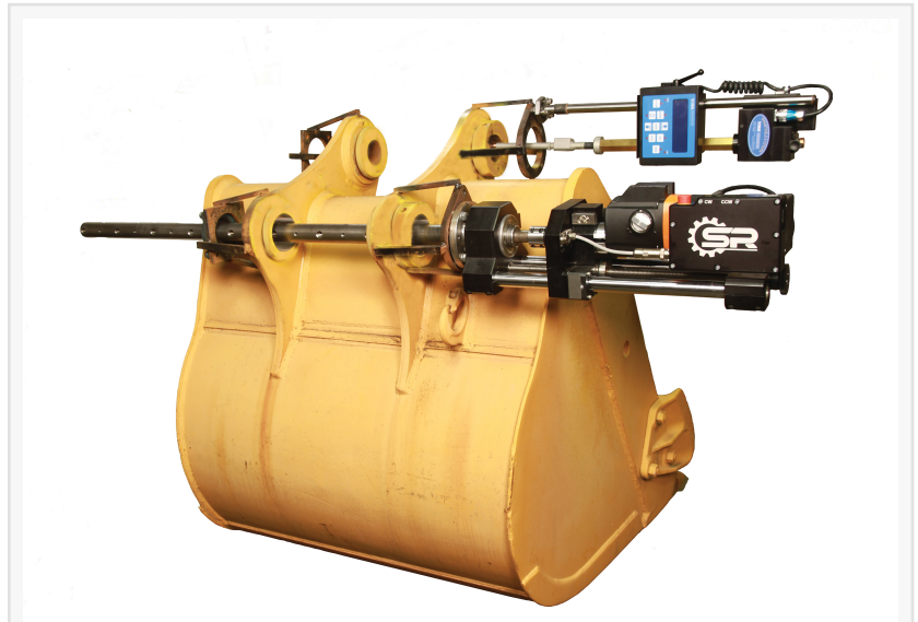
The all new 4-14 S2 Line Boring Machine on a Bucket

With the goal of increasing performance, utility, and ease of use, SPR is proud to announce the release of the all-new 4-14 S2 line boring machine. "As we considered the next evolution of the 4-14 product line, we asked our customers for buy-in on how we could improve this product. With many new and upgraded features, the S2 is our most advanced 4-14 line boring machine yet. The new S2 is another example of our commitment to keep innovation and technology forefront as we continue to improve our product lines, increase our product offerings, and add value for our customers." says Eric Dunkerson, President of Superior Plant Rentals, LLC .