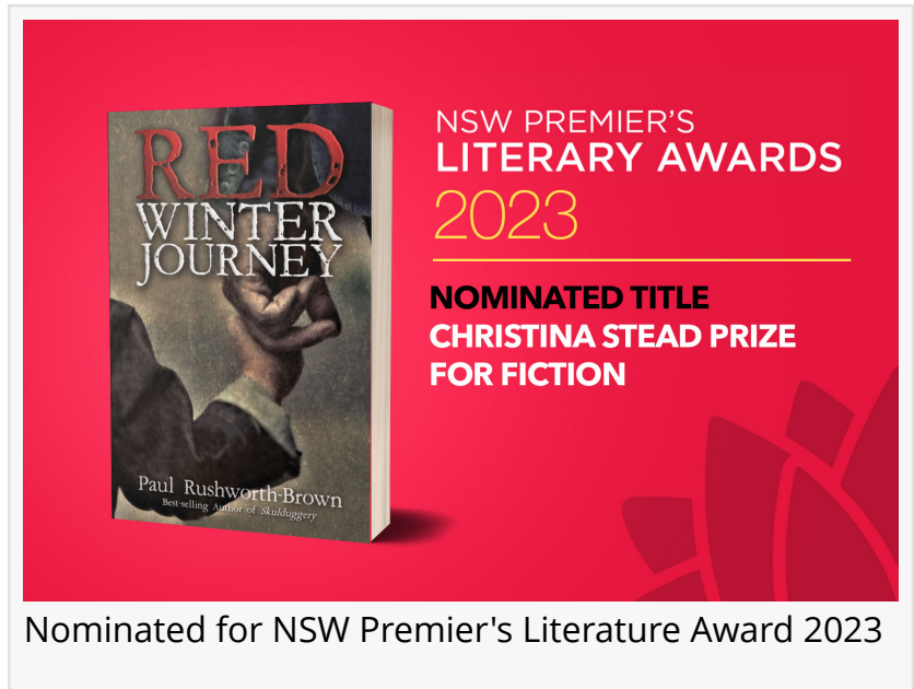
Nominated for NSW Premier's Literature Award 2023

surviving in the time of the English Civil War; however, the story goes much deeper and focuses on the love of a father for his son and his plight to rescue him.