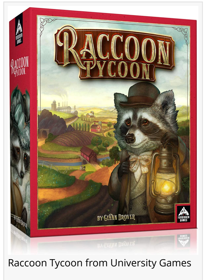
Raccoon Tycoon from University Games