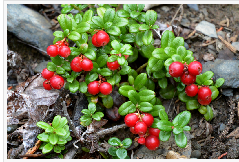
Alpine Cranberry (Vaccinium vitis-idaea), also known as Lingonberry

About Alpine Cranberry Alpine Cranberry (Vaccinium vitisidaea); also recognised as Lingonberry and low-bush cranberry, is known for its potent antiseptic, antioxidant, and diuretic properties. Flush out toxins; prevent and treat urinary tract