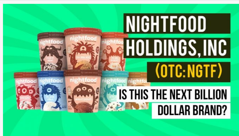
NGTF Stock Symbol

□ Nightfood Adds Hotel Distribution with Managed Lobby Markets Provider GrabScanGo.