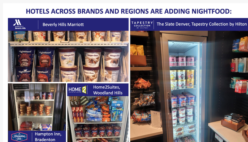
NGTF in Hotels across America