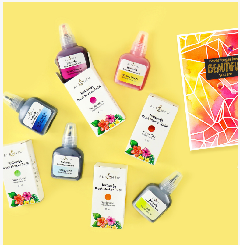
The liquid watercolors coordinate with watercolor brush marker colors from the Altenew color families.