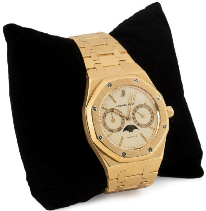
Audemars Piguet 18k yellow gold watch, model Royal Oak 1204, with an automatic movement, yellow dial, moonphase/date/day of week sub dials (est. $30,000-$50,000).

A three-stone platinum and 9.51-carat diamond ring, featuring two oval and one cushion-cut