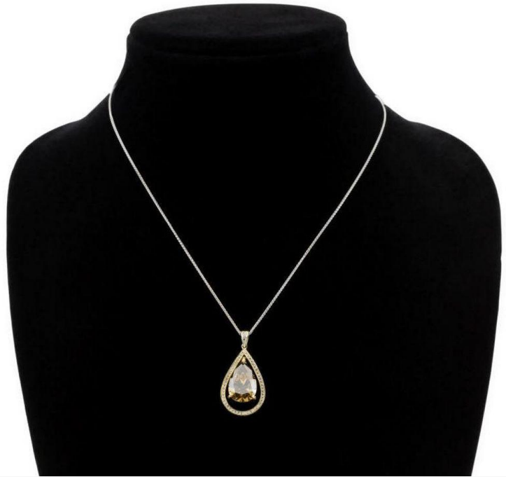
Neiman Marcus pendant with an 8.00-carat, pear-shaped, brilliant cut cognac diamond with VS-2 clarity, brown in color, in a tear drop shape frame (est. $65,000-$130,000).