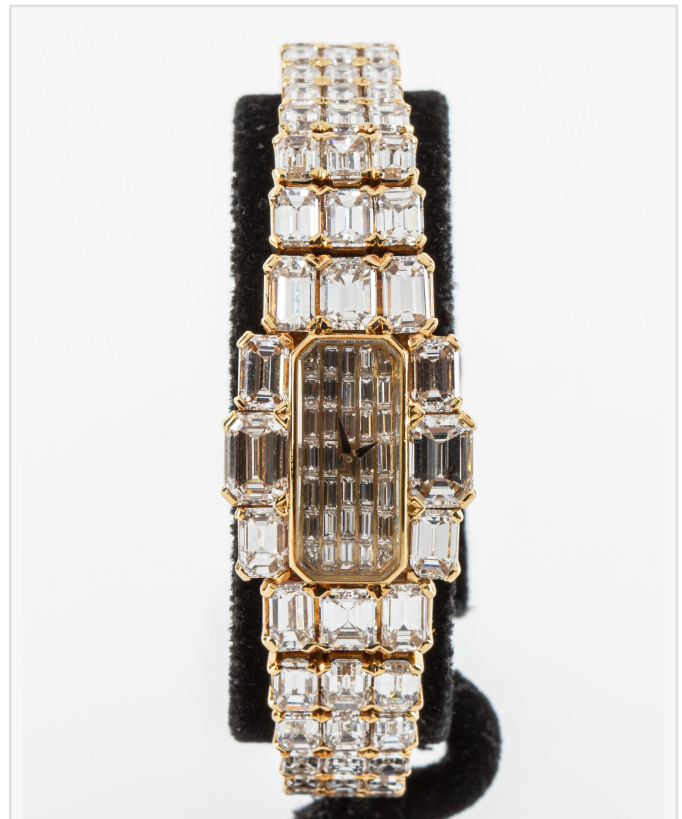
Stunning ladies' Vacheron Constantin 18k yellow gold Metiers d'Art Lady Kalla diamond watch with diamond dial and diamond accented bracelet (est. $150,000-$175,000).

A Neiman Marcus pendant with an 8.00-carat, pear-shaped, brilliant cut cognac diamond with VS-2 clarity, brown in color, three prong set in a tear drop shape frame in 18k yellow gold and platinum, the frame containing round brilliant accent diamonds weighing 0.55 carats (VS-clarity), on an 18k white gold accent chain, should hit $65,000-$130,000.