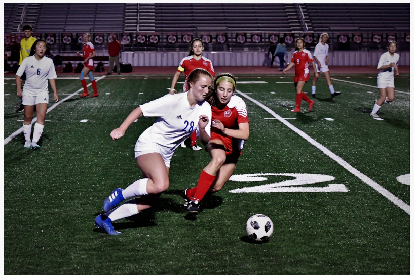
High School Athletics