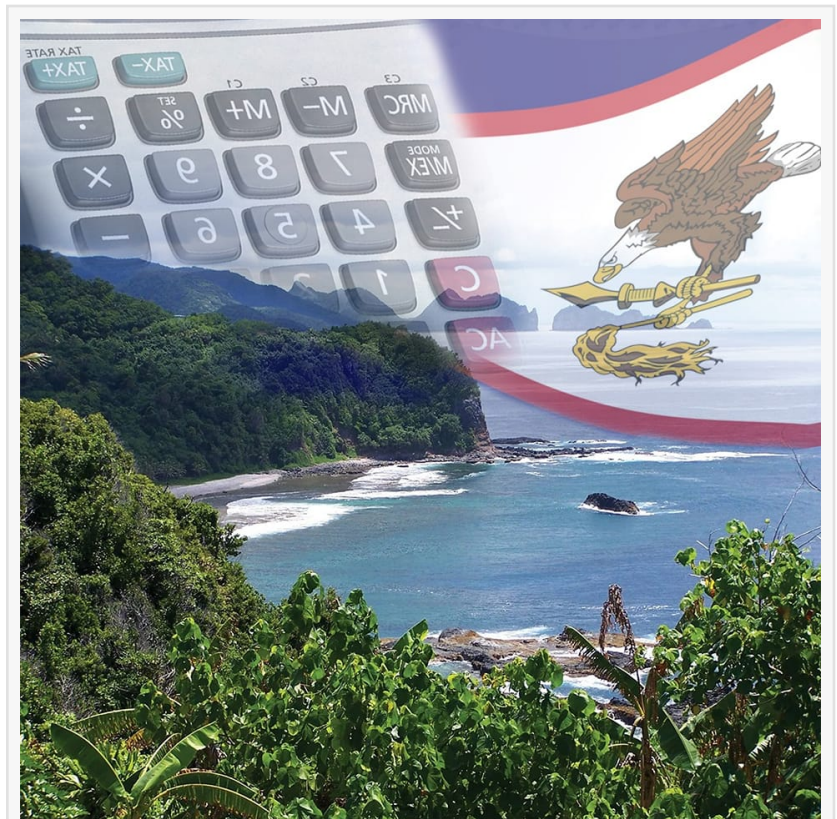
Fastest Growing LLC in USA