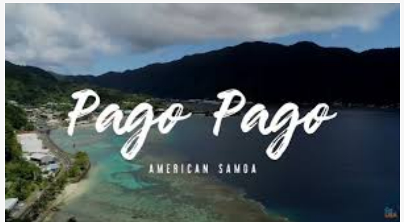
Pago Pago, American Samoa